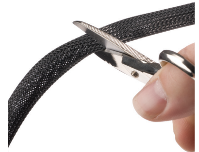
Clean Cut® cuts easily and neatly with regular scissors and maintains a fray resistant end during installation.